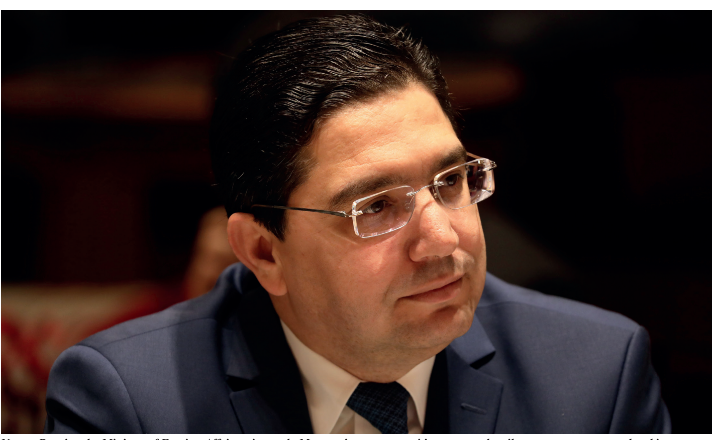
Nasser Bourita, the Ministry of Foreign Affairs reiterated «Morocco's constant position not to subscribe to any agreement or legal instrument that does not respect its territorial integrity and national unity»

Morocco's reaction was swift. The Ministry of Foreign Affairs issued a press release expressing Morocco's firm position. It began by stressing that «the Kingdom does not consider itself in any way concerned by the decision of the Court of Justice of the European Union» , since it «did not participate in