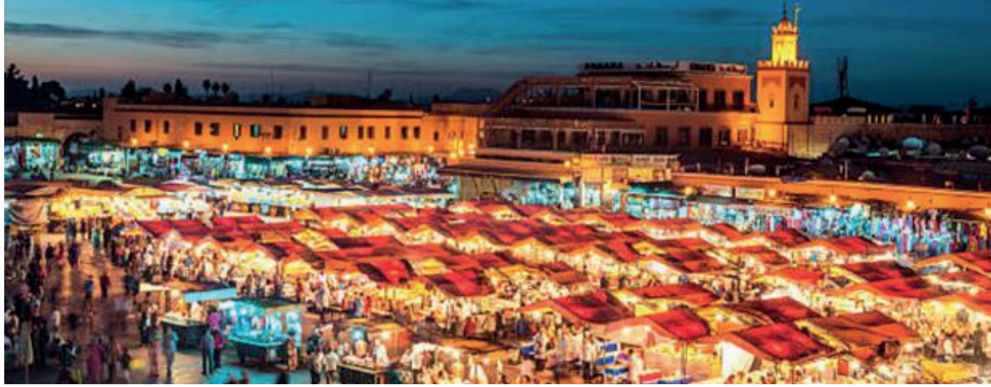
Foreign tourists up 13% over the eight months to 2024. Marrakech and Agadir attract the biggest share

Per city, Marrakech, Agadir, and Tangiers fared best. The Ochre City recorded 976,548 overnight stays, followed by Agadir with 808,082. Casablanca maintained its performance, despite a slight drop of 3%, while Essaouira suffered an 8% decline in August. With 88,356 overnight stays, Al Haouz did well and ranked 7th, doing better than Rabat and Al Hoceima. Overall - from January to August - Morocco received 11.8 million tou-