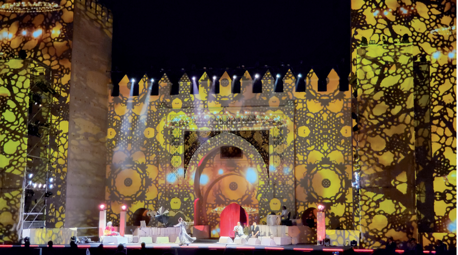
The Bab El Makina square lends a great deal of charm and magic to the Fes Festival of Sacred Music. Distinguished personalities come here to enjoy original shows. The inaugural show is one of them