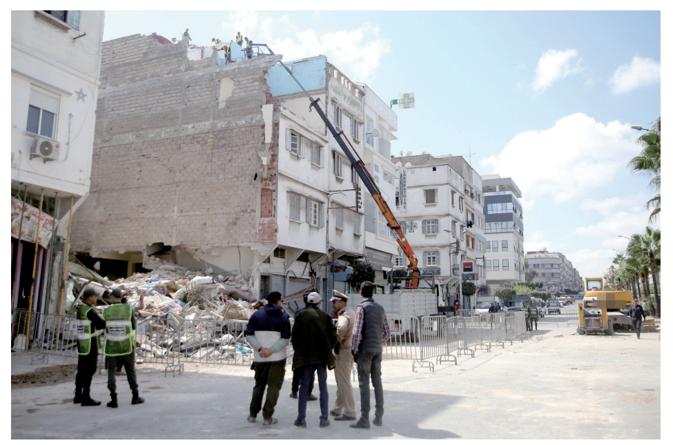
Caption: Illegal constructions that cannot be regularized and for which a list of irregularities has been drawn up are to be demolished.

N 2019, the Government had tained from the Ministry of Housing, ting permits for repair, regularization, launched a regularization only 2,898 regularization requests were filed with the relevant departconstructions except that the ments in accordance with decree no. operation did not deliver the expected 2.18.475 of June 12, 2019 setting the results since, according to figures ob- procedures and modalities for gran-