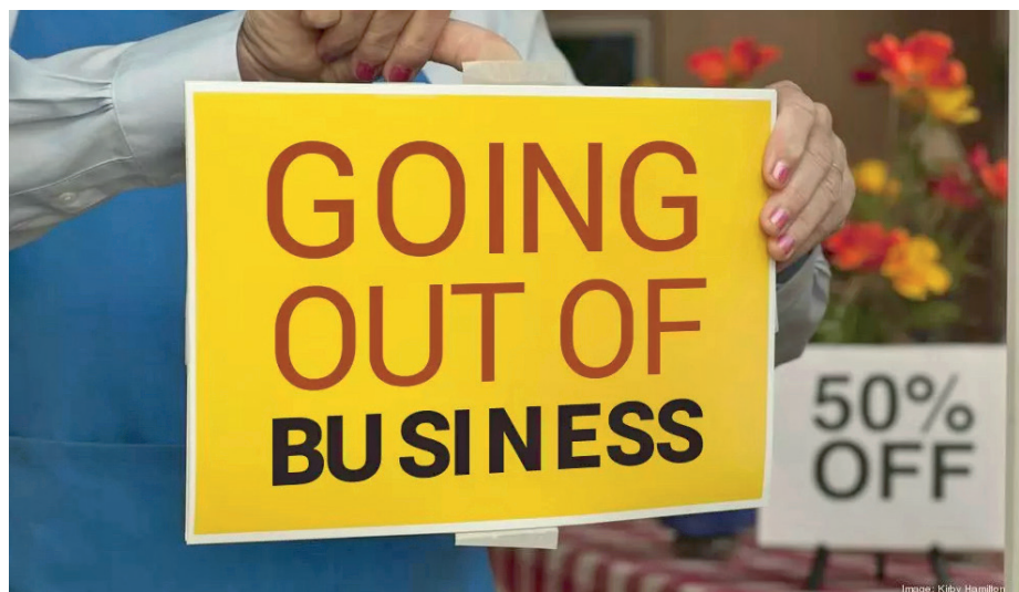
Casablanca has the highest number of business failures. It is followed by Rabat, Tangiers, and Marrakech. Per sector, retail has the highest rate: 33% versus 20% for real estate

Very small businesses remain at risk: 98.6% of insolvencies concern them, compared with 1.3% for SMEs and 0.1% for large companies. “Moroccan companies are currently experiencing many difficulties, including great pres-