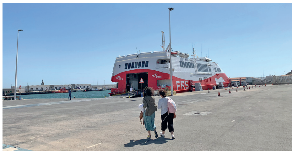
The volume of arrivals of MRAs (Moroccans Residing Abroad) will peak during the first week of July, in anticipation of Eid Al-Adha

OPERATION "Crossing the Strait" begins to gain momentum. After a slow start on June 5, as usual during this operation, the flow of travelers is starting to accelerate. At the time of this issue of the paper going to press, the number of travelers having arrived at the port of Tangier Med reached 20,000 passengers, while the number of entries stood at just over 12,000, according to sources close to the port authorities. In total, some 9,000 vehicles passed through the quays of the port, most of them heading to Morocco. The number may seem rather small, but it is a source of comfort for shipping companies, businesses, but also for tourist operators, among the main economic players boosted by the presence of MRAs (Moroccans residing abroad). According to forecasts, it is expected that the total number of Moroccans in the diaspora