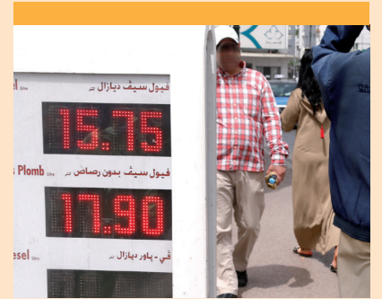
Fuel: The great impasse

the labor market...to increase interest and reduce the costs of entering the formal economy, as was highlighted by the Deputy Managing Director of the IMF in an interview with L’Economiste. The major social protection project is one of the answers to this phenomenon. This safety net will enable beneficiaries to ward off the most brutal aspects of precariousness, to earn a decent living, and to have more rights. One of the sectors that will also be the most scrutinized is that of the health system, which must confirm its ability to initiate a transformation shock equal to the challenge. It is a question of betting on goals, efficiency, and optimization of resources. This major project will be successful only if the main parties concerned play the game as fully as possible. It is therefore all this social engineering as a whole, which, if it is well carried out, will allow Morocco to close the parenthesis of an era that we would like to forget about. ... □