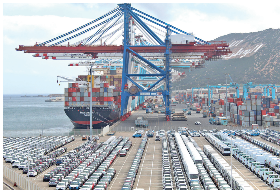
Today, the challenge is to speed up the pace of achievements and multiply investments or even implement end-to-end digitalization